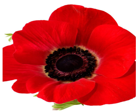
WEAR YOUR POPPY PROUDLY

In fact, unless you have difficulty walking, please consider parking away from the front of the building in order to allow those who may be physically restricted easier access and exit. Thank you for your consideration.