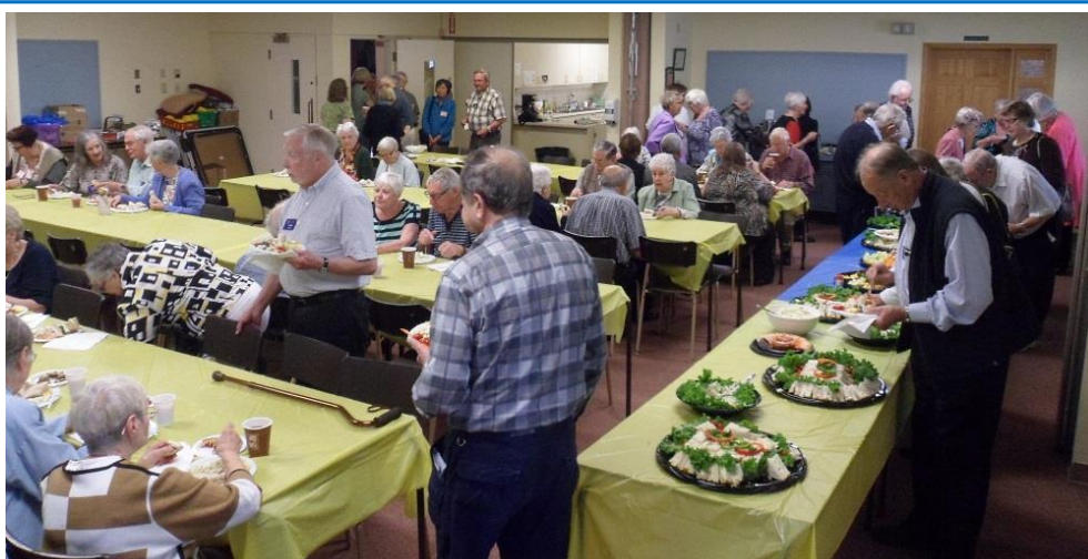
End of year luncheon. There was a good turnout for our end of year catered light luncheon in June.

For further information call Pat Stoate at 613-820-0174