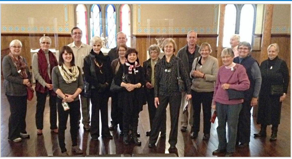
Despite the snowstorm a large group was still able to participate in the combined tour of the Royal Canadian Mint and the National Gallery of Canada on 17 February.