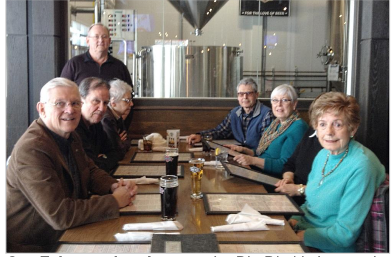
Our February luncheon at the Big Rig kitchen and Brewery was highly enjoyable and very well attended. This photo only shows some of the group.