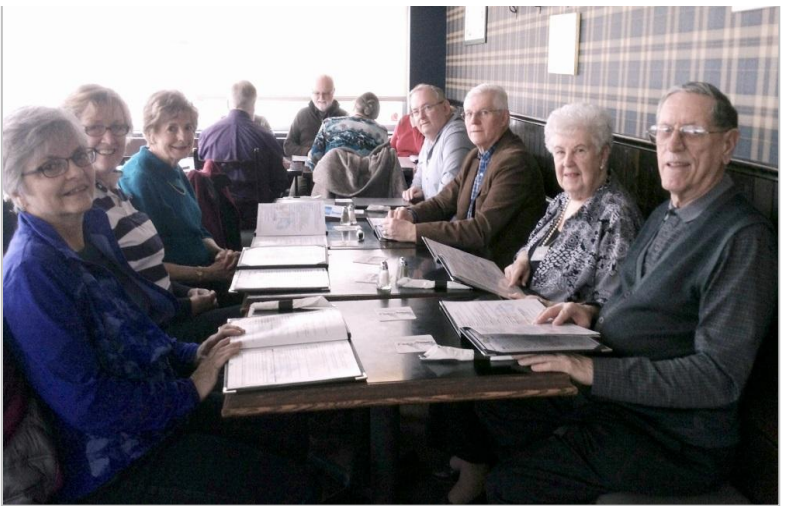
The Gen Scottish Restaurant and Pub in Stittsville was the venue for our March luncheon with members enthusiastically recommending it for another visit.

The left side menu lets you go to any of the featured pages. Links are also provided for our photo page.