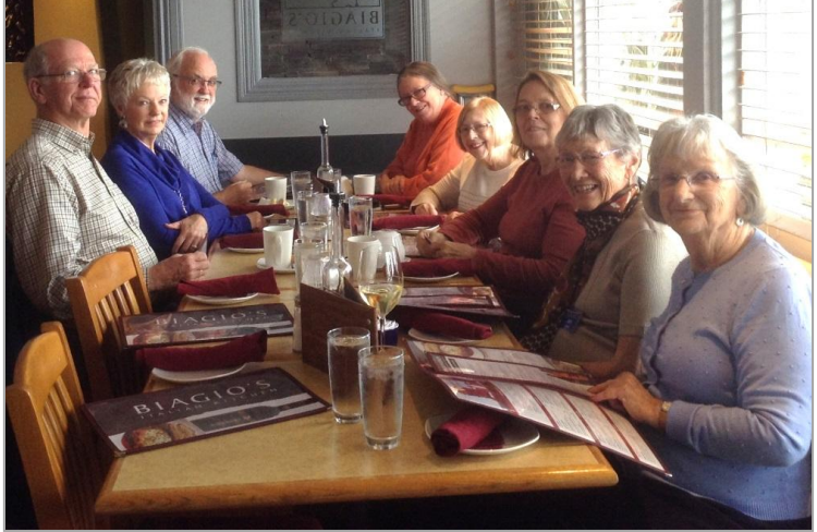
Biagio's Italian Kitchen was the venue for our October lunch-out with 18 members participating.