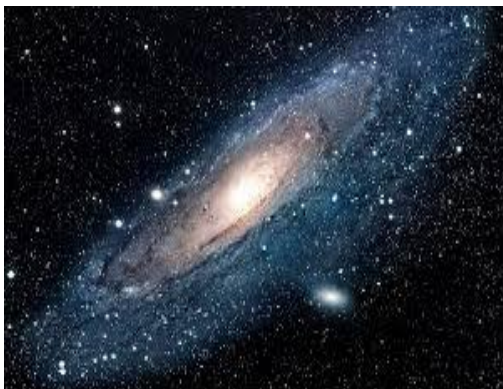
The Milky Way

One of the most popular questions today is, "Are we alone in the universe?" Believe it or not, you're in the minority if you believe that absolutely no intelligent life exists outside of planet Earth. According to