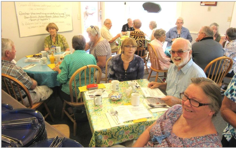
The Miller's Oven was the venue for lunch prior to our Manotick walk. (More photos on the website)