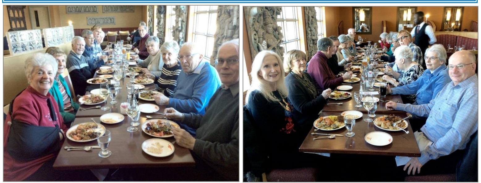
The East India Company restaurant was the venue for the March lunch-out. Sixteen club members enjoyed an East-Indian menu in this Bells Corners restaurant which was formerly Al's Steak House.