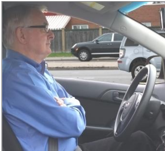
Look ma, no hands

It has been said that soon there won't be a need to have drivers at all behind the wheel. So what is this driverless car thing all about?