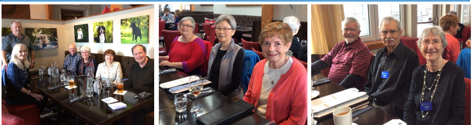
The Black Dog Restaurant proved to be a popular venue for our lunch-out in April with a large number of club members taking part.