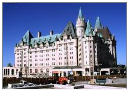
opportunity to have High Tea in the Chateau's Zoe's Lounge.