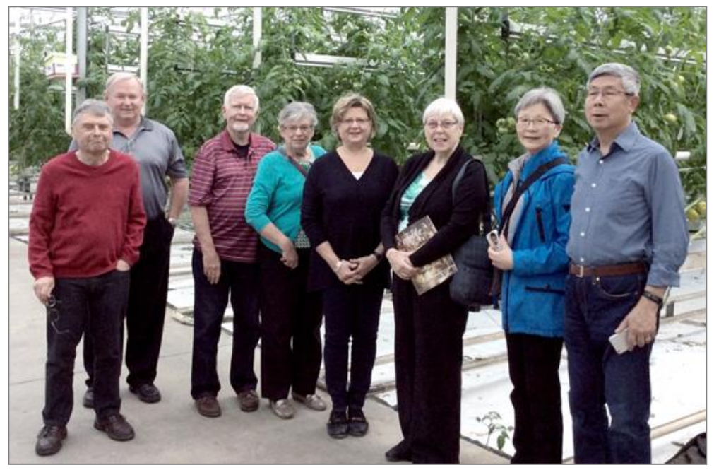
SunTech Greenhouses. After the April lunch-out in Manotick a number of members participated in a visit to SunTech Greenhouses which produces year-round local tomatoes and produce.

Probus has an active euchre and bridge group. They meet monthly at