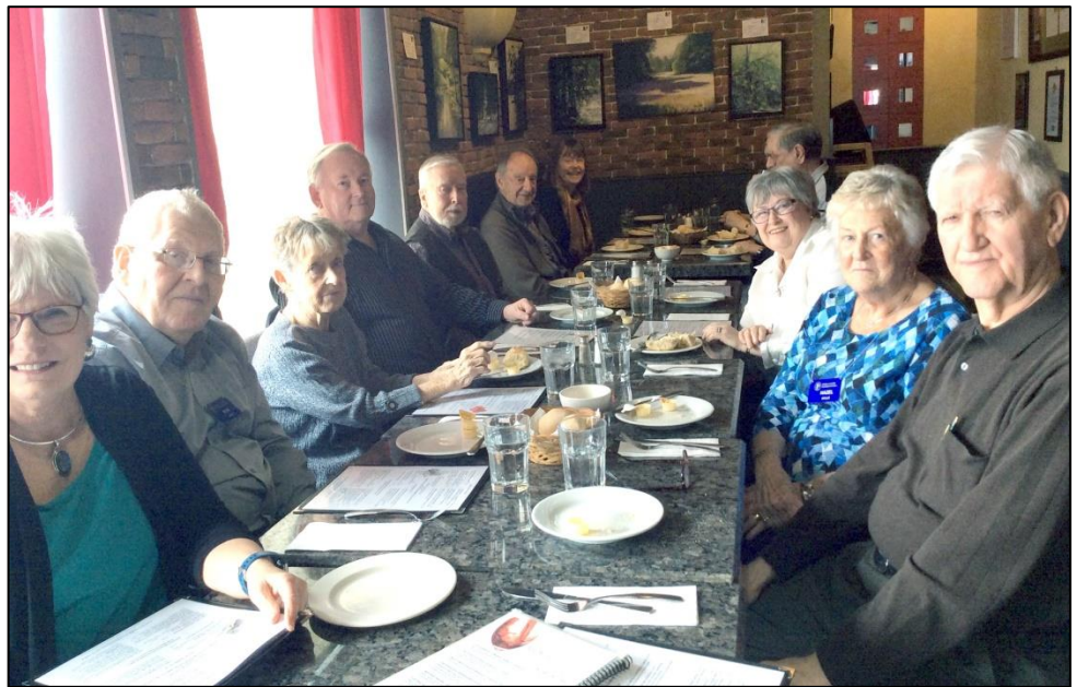
Zolas Restaurant again proved to be a popular venue for our February lunch-out.

At the beginning of the meeting we ask for a show of hands of those planning to attend so that we can reserve.