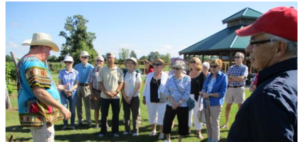
Sept. 14 Jabulani Winery Tour: Listening to the owner explaining the hand picking method they use to gather the grapes

1 pm, Tuesday November 6 Address: 60 Colchester Square, Kanata (behind OPP station) Phone: 613-599-1424 Cuisine: Seafood Grill Website: lapointefish.ca/kanata/ Sign up at the October meeting.