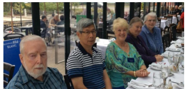
Lunch at the Canal Ritz – September 19