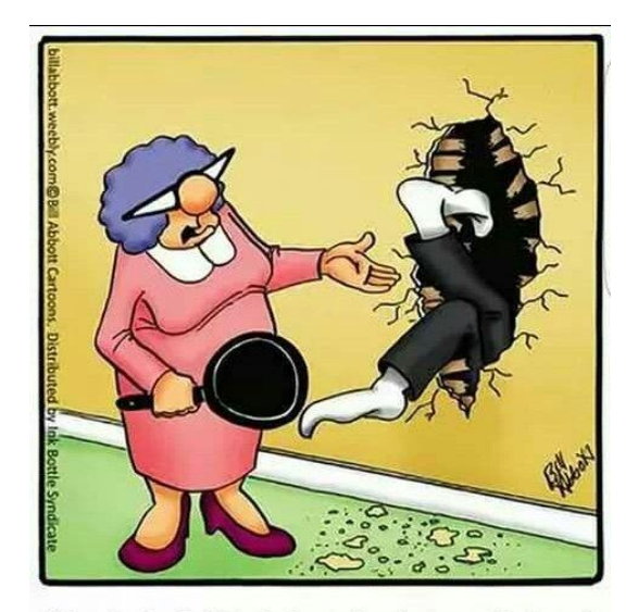
"I admit, I didn't handle that well, but I don't want this to discourage you from being honest with me in the future."