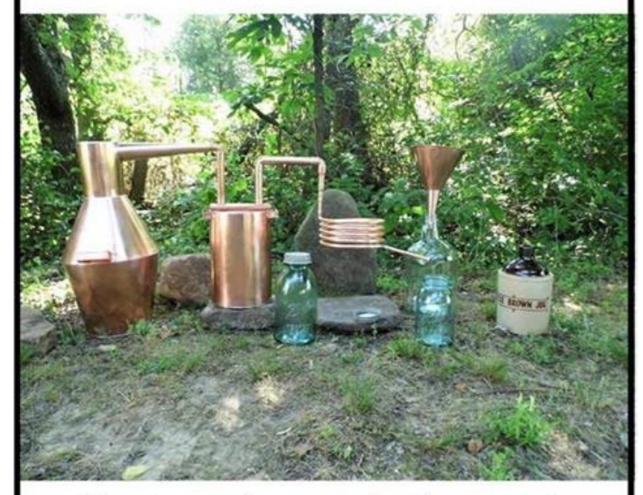
Next week - marketing and distribution.

Home schooling science lesson went really well this week.