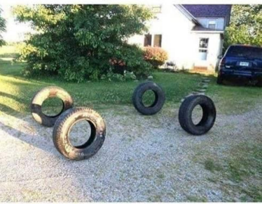
Truck for sale. Needs parts. Serious inquiries only

long story short, I'm going back to toilet paper