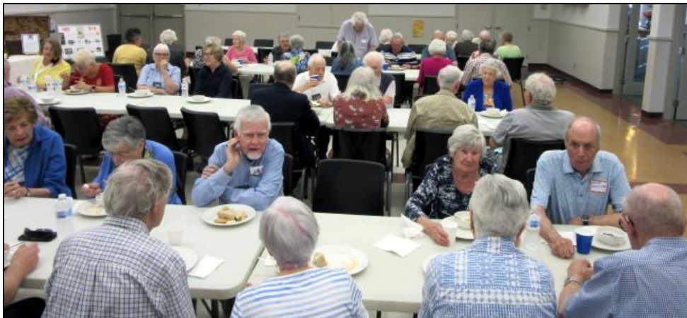
June Luncheon. We had a good turnout for our catered luncheon in our meeting hall after our final meeting last year.

Another alternative to pay your dues is via e-Transfer to membership@probuswesternottawa.ca . Detailed e-Transfer instructions can be found HERE . Make sure to indicate the names of all persons you are submitting fees for.