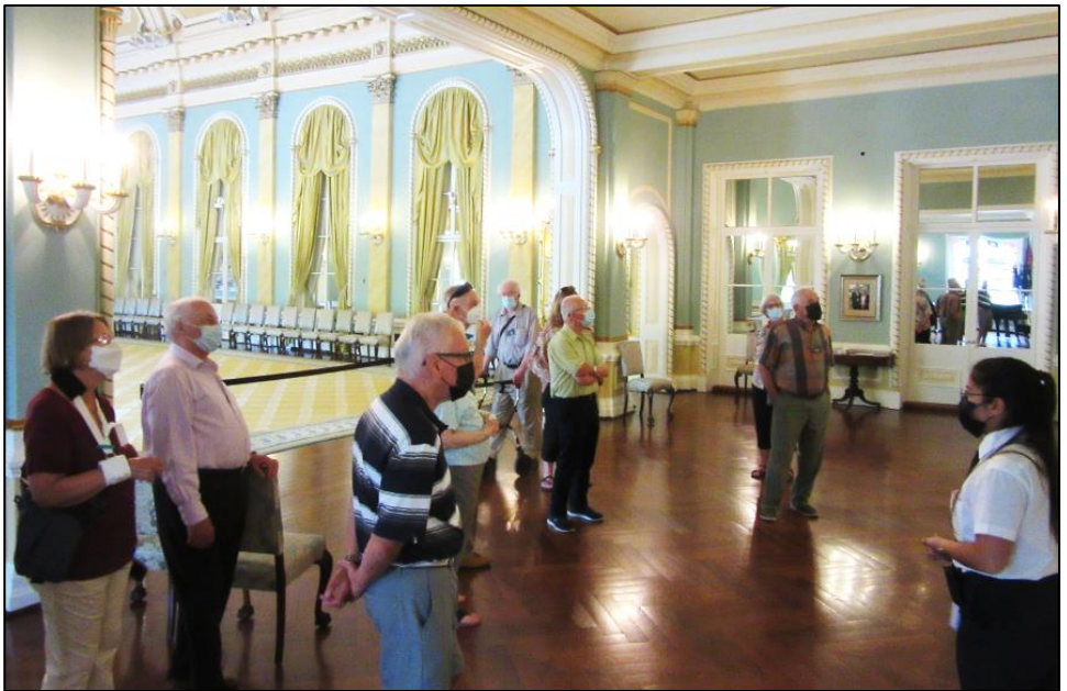
Rideau Hall Visit. As our final tour last year, a number of members visited Government House. We were given a guided tour which described the rooms and the extensive history of this national treasure.