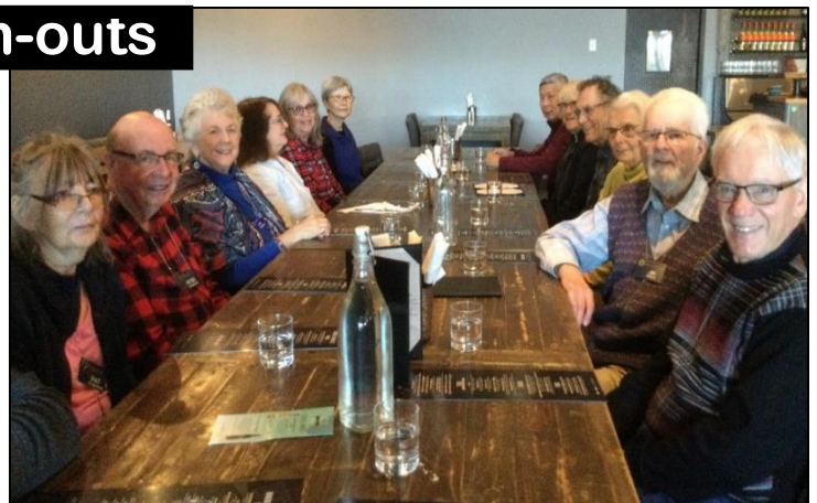
OCCO kitchen in Orleans allowed us to recuperate after our Petrie Island nature walk.