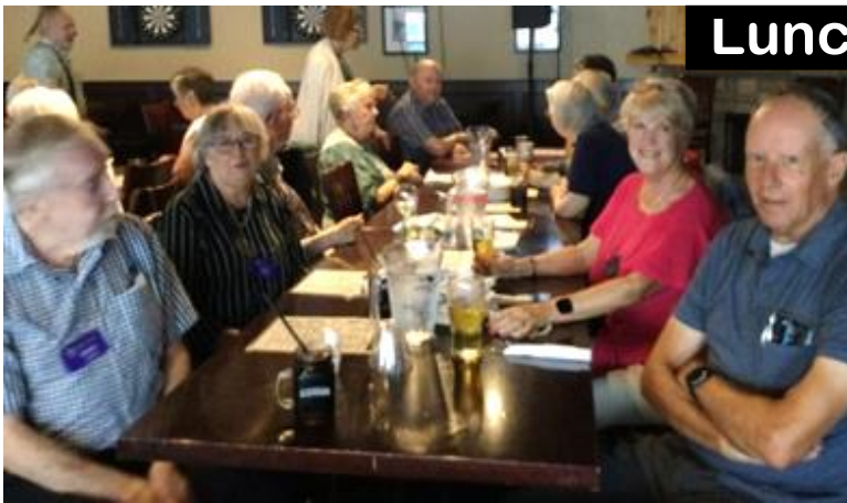
Moose McGuires was the venue for our lunch-out following our September meeting with a good turnout.