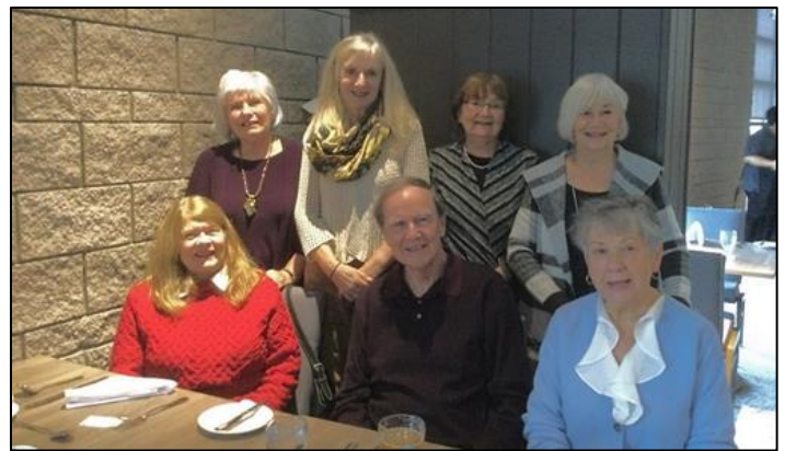
Christmas luncheon. This year we held our Christmas Luncheon early. Even then, we had to split it over two days. These are just some of the 50 members who enjoyed the savoury luncheon at Algonquin College.