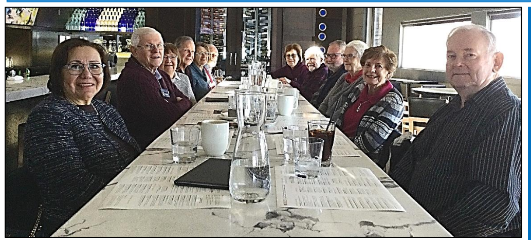
January Lunch-out. Our monthly lunch-outs continue to remain popular. This photo shows just some of the group that enjoyed lunch at Moxies in January.