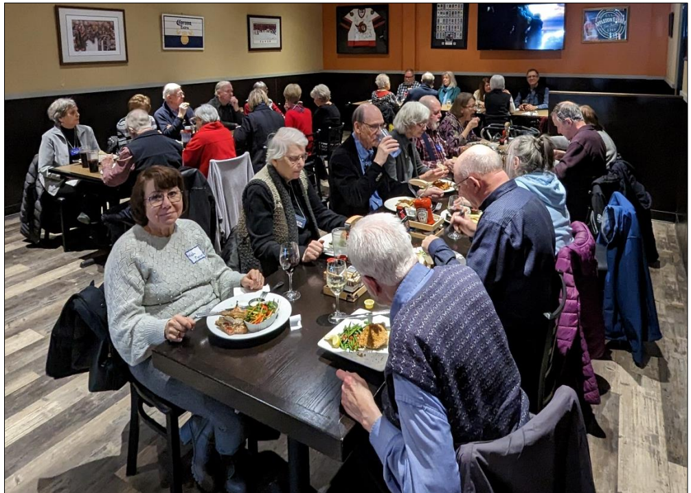
After the Speaker Lunch. Our monthly lunch at Busters Restaurant brought out a large crowd.

We try to have a little fun each day now that we're retired.