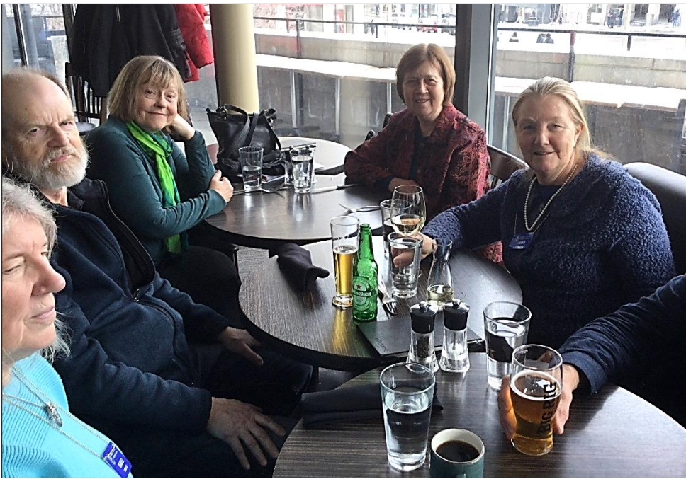
Milestones downtown was the venue for our lunch after taking part in the tour of the temporary Senate.