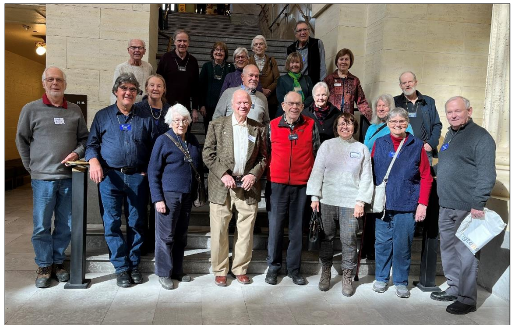
Senate tour. Almost two dozen club members had an informative tour of the temporary Senate now housed in the old Ottawa Union Station.

Western Ottawa Probus meets at Kanata Baptist Church 465 Hazeldean Road