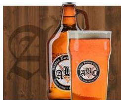
Ashton Brewing Company